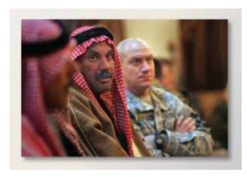
The military services have undertaken efforts to increase cultural awareness among American forces

It is possible that OSD obtain interagency agreement and congressional support for a training center focused on developing teams of government and nongovernment representatives as Provincial Reconstruction Teams. or anv future equivalent. The present gap in capabilities for stability operations is governmentwide, extending well beyond DoD. That gap is generated by time-distance and fiscal constraints: non-DoD entities are reluctant to devote personnel to participate in pre-