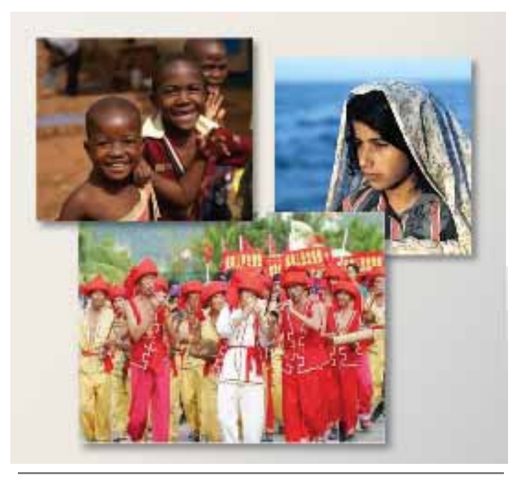
An understanding of human dynamics is important to operators and analysts during peacetime as well as wartime

are good assumptions. At other times, they are dangerously inappropriate.