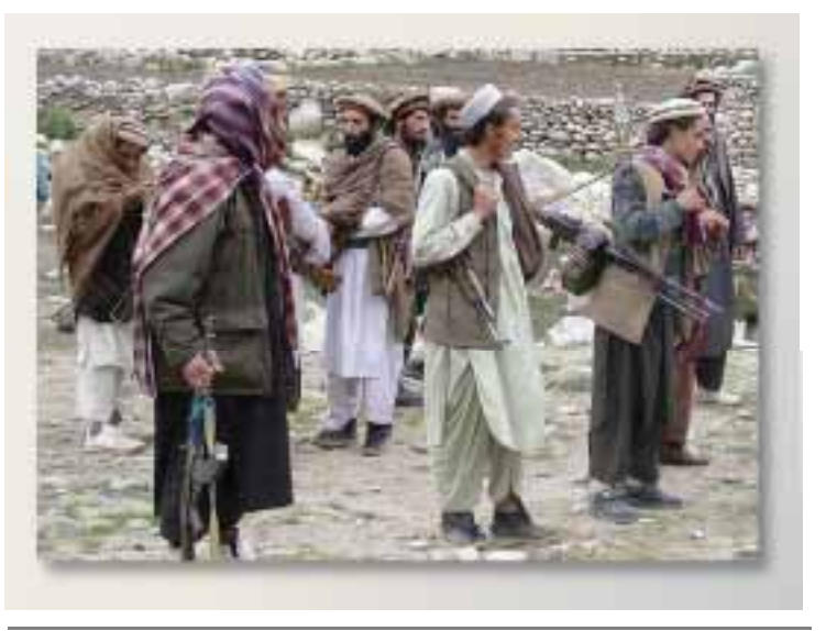
Military operations will more frequently occur among populations...

Operational tempo will increase in response to the pace of events in a networked world. Events in the diplomatic, informational, military, and economic spheres continue to evolve at an increasing rate of speed. Increased responsiveness from U.S. military capabilities will be required in order to retain initiative and to capitalize on emerging opportunities. Maintaining an awareness of information, misinfor-