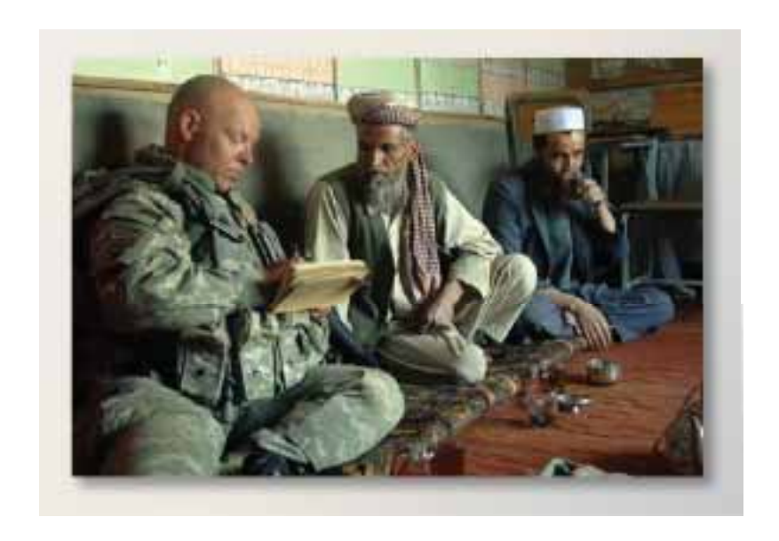
Human Terrain Teams, currently deployed in Iraq and Afghanistan, collect and analyze socio-cultural information.

The Human Terrain System (HTS), which includes forward deployed Human Terrain Teams, a Research Reachback Center for support to forward teams, a Subject Matter Expert Network for additional research and analysis, and the Mapping the Human Terrain Toolkit for archiving and visualization of sociocultural information. Human Terrain Teams are trained and deployed for direct support at the brigade, division, and corps level. These teams collect and analyze socio-cultural information and assist commanders and staffs in using that information in their planning and decision-making. They also serve as "institutional memory" during unit rotations. Teams are currently deployed in Iraq and Afghanistan with all brigades, divisions, and corps. Success of these teams is tied to the focus on capability where it is most needed—at the tactical level where understanding and interaction with the local population really matters. Having teams at multiple echelons allows for aggregation of socio-cultural information, providing a common operating picture to units at all levels.